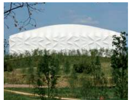
PVC containing phthalate plasticisers used on the Basketball Arena, as the material was procured before issuing the PVC Policy