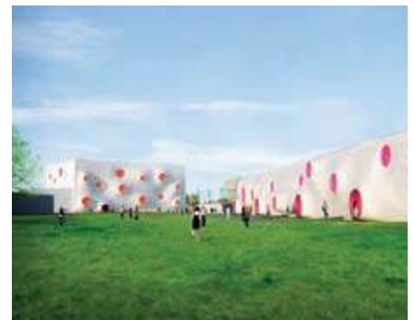
Phthalate-free PVC was used on the temporary shooting ranges at the London 2012 Shooting Venue

If a PVC based material was to be adopted a justification report was required setting out how the material was meeting the mitigation requirements above.